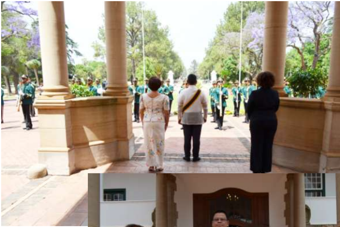
Reviewing the honor guard